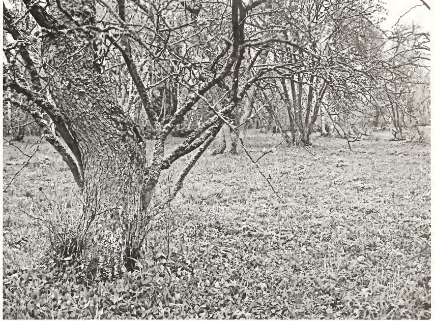
Fig. 3: Wooded meadow (site 5).

in the recent Finnish Red Data Book (Pajunen et al. 2010). Jungfruskär (where the species was found on both wooded meadows) represents its third locality in Finland. In addition, Micaria fulgens , found in wooded aspen pasture, is listed as NT (nearly threatened) in the Red Data Book.